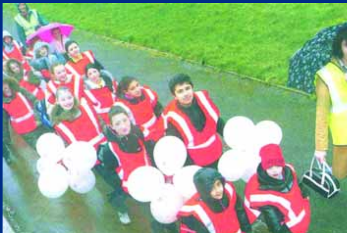
Fig 1 Walking Bus at St Edwards National School Sligo.

At its most recent meeting on September 8th, 2004, the Integrated Transportation Co-ordinating Group of the Galway City Development Board agreed to develop walking buses on a pilot basis in the Mervue, Renmore, Westside, Ballinfoile and Castlegar areas of Galway City. Spearheaded by the National Safety Council, the Transport Group anticipates that following detailed survey analysis, trials will commence in these communities by Easter 2005.