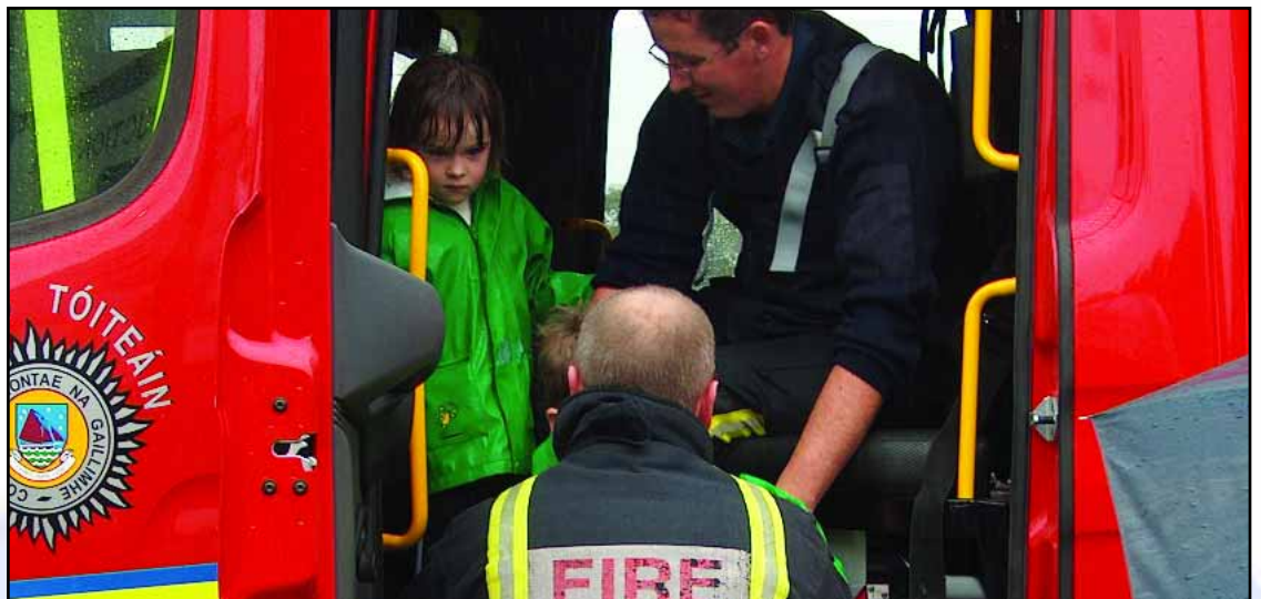
Children getting a tour of a fire engine on Children's Day. See pg 4

Welcome to the 12th issue of the Galway City Development Board's Newsletter