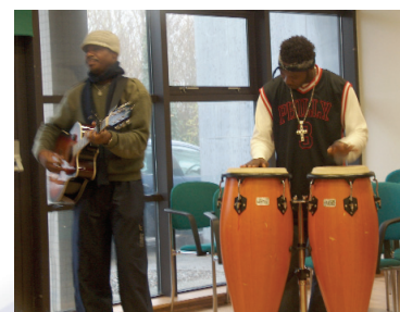
The Baslowa Band