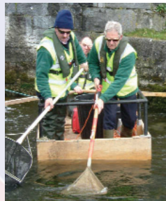
Fisheries Board staff relocating fish prior to canal cleanup

The City Development Board under the auspices of the Natural Environment and Waterways Group commenced a major cleanup and desilting of one of the city's most attractive stretches of canal in early March 2005. This section of the