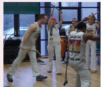
The Grupo Candeias showing Capoeira

A Summary Document of the strategy was also launched and is available in 9 languages including English, Portuguese, Spanish, French, Irish, Chinese, Russian, Arabic and Braille.