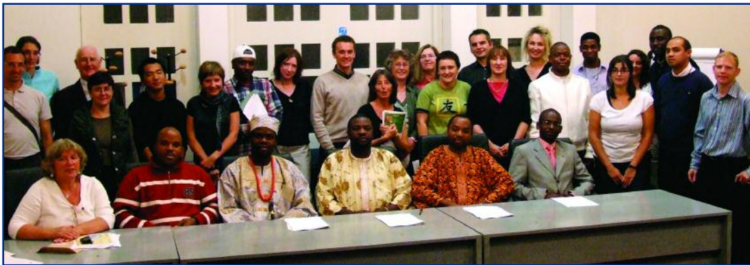
Galway City Community Inter-Cultural Forum

Galway has seen a great increase in the presence of foreign immigrant populations; in response to this the Galway City Community Forum in partnership with Galway City Partnership is facilitating the establishment of the Galway City Intercultural Forum . As a representative voice for the many diverse cultures now living in the city, the Forum will be in a better position to meet the needs of their community groups rather than working in isolation. As the Intercultural Forum develops it may also be in a position to elect representatives to local development groups where they can meet city councillors or officials from local state agencies.