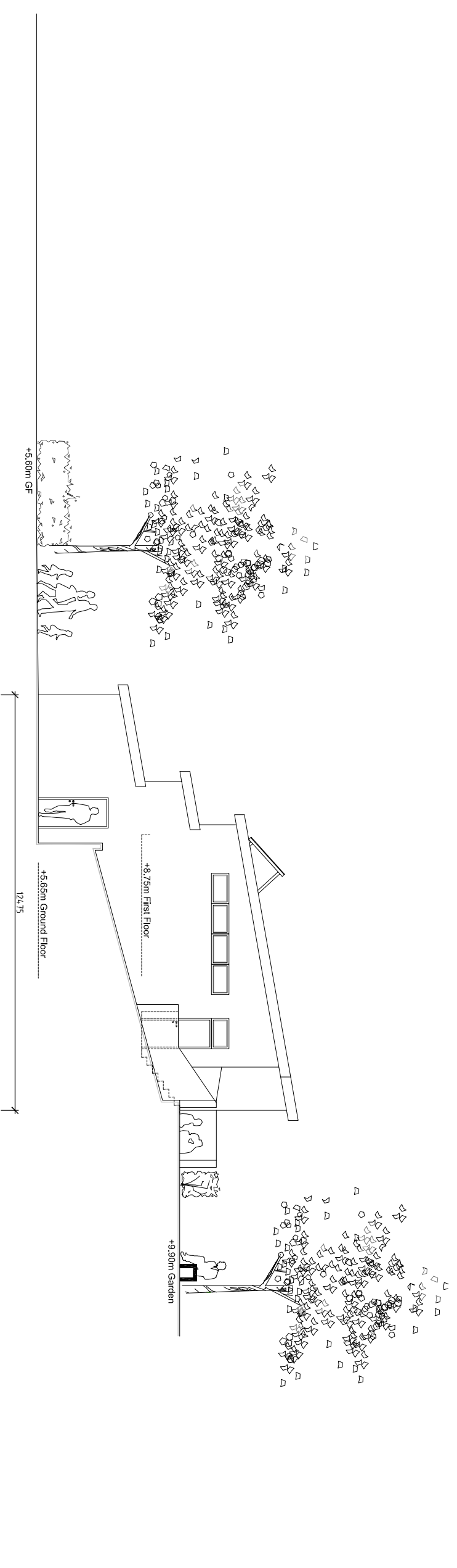
4 South Elevation

NOTES: DO NOT SCALE FROM THIS DRAWING - WORK ONLY FROM ISSUED DIMENSIONS ALL ERRORS AND OMISSIONS TO BE REPORTED TO THE ARCHITECT THIS DRAWING TO BE READ IN CONJUNCTION WITH RELEVANT CONSULTANT'S DRAWINGS