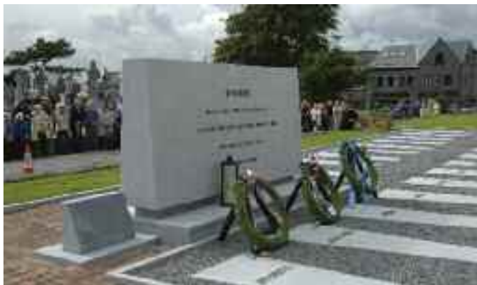
Above: Three wreaths placed at the commemorative plaque for the victims of the 1958 'Hugo de Groot' KLM Air crash disaster.

The religious services of 6 denominations were conducted at Galway Regional Hospital before the funeral of the victims. All business closed down on the funeral route as the cortege, the largest ever seen in the city, passed through the silent sympathy of a vast throng of citizens