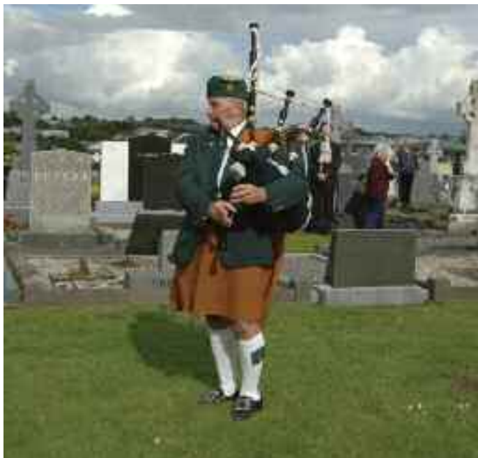
A lone piper plays at the KLM Commemoration Ceremony at Bohermore Cemetery.

By Friday morning thirty-four bodies had been recovered, 9 male, 25 female. On 6.30 on Friday afternoon the first ship sailed slowly into the Dun Aengus dock watched by a huge silent crowd. Only 12 of the 34 bodies could be positively identified prior to the funeral which was held on August 19th 1958. The remains of eleven of these were flown back to their native countries. One of the bodies was that of a 14-month-old infant who lost her parents in the crash. The baby girl was buried in a separate grave close this spot where the unidentified remains of the crash victims lie. The infant's Grandmother and Uncle attended the burial and they expressed their appreciation of the sympathy shown by the people of Galway and that the infants' relatives would remember it all their lives.