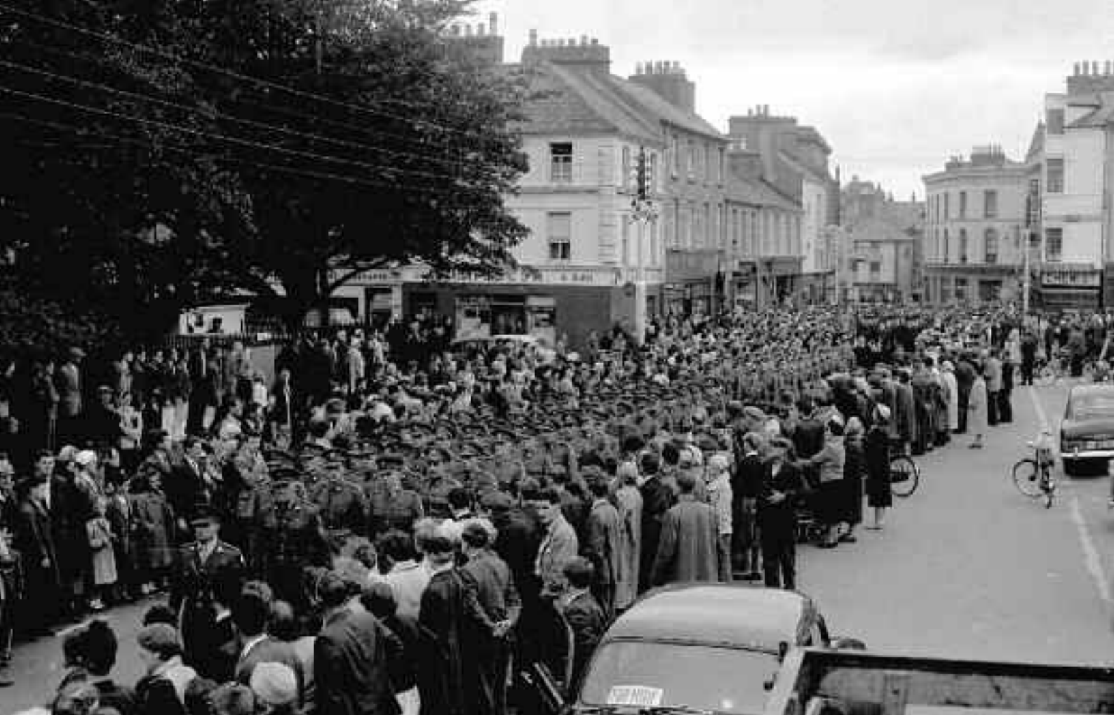
A vast throng of citizens lining the funeral route to the New Cemetery in Bohermore pay their respects as the cortege pass – 14th August 1958.