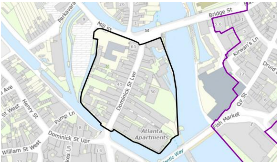
Lower Dominick Street Architectural Conservation Area (ACA)